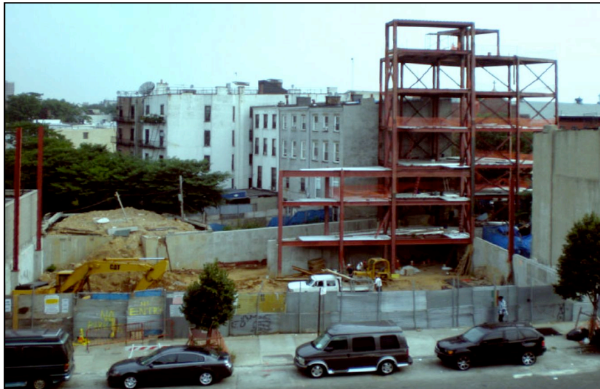
Foundation and steel construction were restricted to north portion of site for nearly five months, but project is now expected to finish on time and within budget.